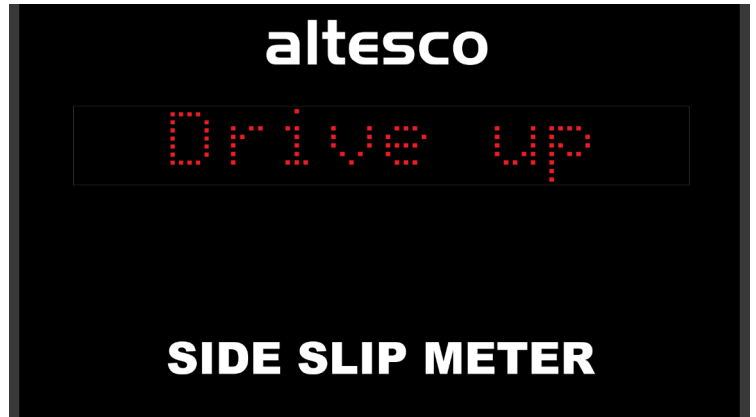
Very compact display SS32: 58 x 33 x 5 cm

Print results direct from the display or connect the display into your network and print via your web browser from any available (network) printer.